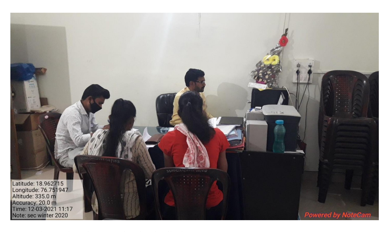
Regarding University Examination in Covid-19