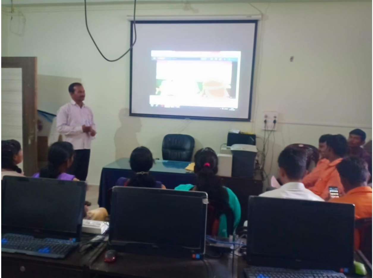
Department of philosophy